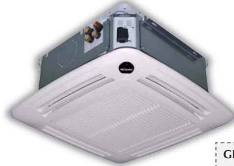
GLLI10 White: RAL 9010